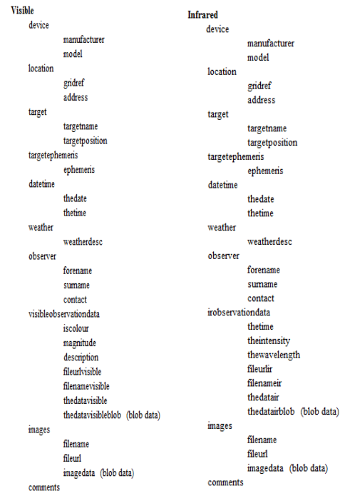
Fig 1: Detail of Visible and Infra-red nodes

It was only after the completion of the Masters research that the usefulness of semantic data was looked at and subsequently incorporated as part of this current doctoral research.